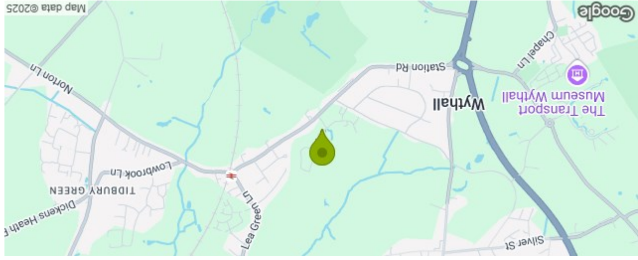
103 Burnham Road Wythall Wyrthall B47 6AS Council Tax Band: D